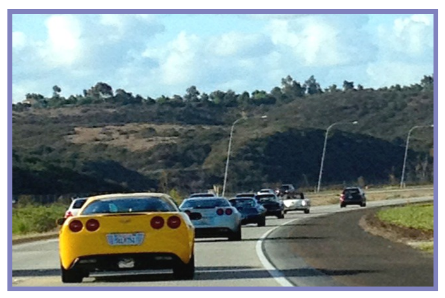
Another beautiful, Corvette filled, fall day in San Diego!